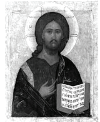
Christ the Savior, Russian Icon, 16th Century.

From Living Without Hypocrisy, Spiritual Counsels of the Holy Elders of Optina